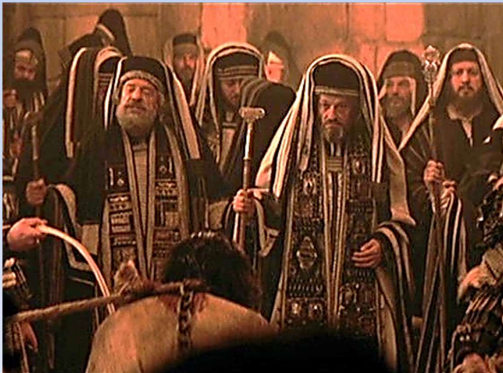
The Sanhedrin (photo taken from the movie "The Passion of the Christ".)