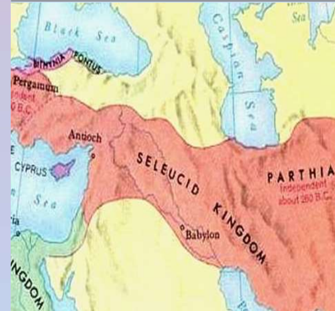
Ptolemies / Seleucids 323 – 165 BC